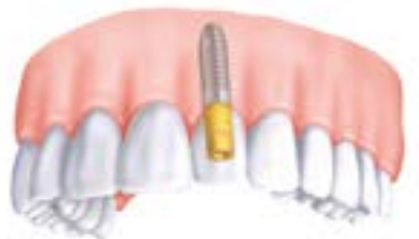
Crown centred on abutment

As treatment does vary so much between patients, we recommend you speak to a dentist.