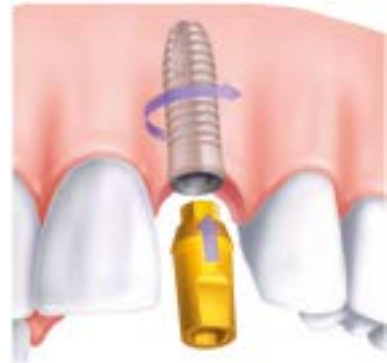
Implant and abutment